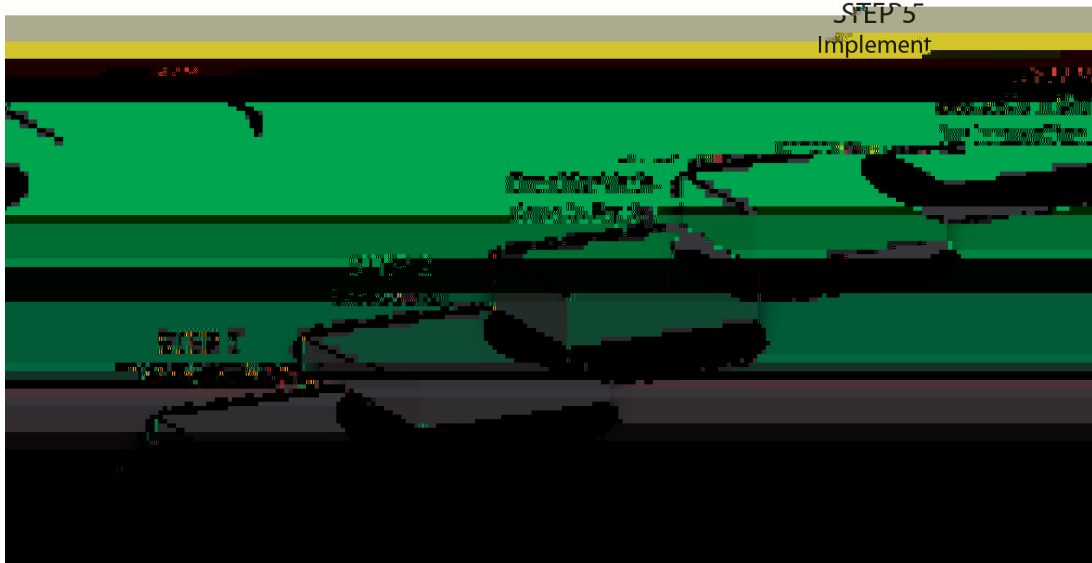
Figure 4: Step 1 of the Orientation and Onboarding System Toolkit

Step 1 engages your organization in an audit to assess the equity of your Orientation and Onboarding System.